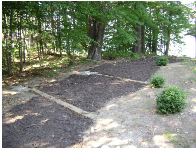
AWWA YCC project on Province Lake - Water bars and Erosion control mulch (ECM)