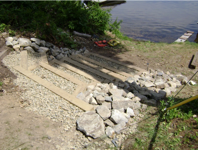
AWWA YCC project on Province Lake - Infiltration steps and rip rap.