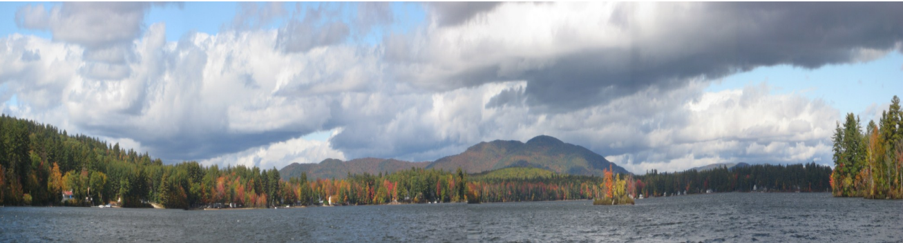
View of Province Lake during the fall.

Province Lake Association: The PLA is a group of people interested in maintaining the quality of Province Lake. It is a non-profit organization of approximately 100 members paying dues of $25 annually. There are many volunteers who provide water testing, weed watching, loon observation and other valuable services to the association.