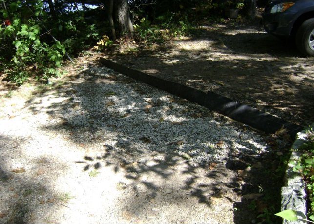
AWWA YCC project on Province Lake - Rubber razors.

Location: Parsonsfield, York County, ME and Wakefield and Effingham, Carroll County, NH Coordinates: 43°41'24"N 70°59'32"W Major Drainage Basin: Saco River, Saco Bay, ME Subdrainage Basin: South River to the Ossipee River Drains to: South River Inlets: Hobbs Brook Outflows: South River Watershed Area: 4,672 acres (7.3 mi 2 )